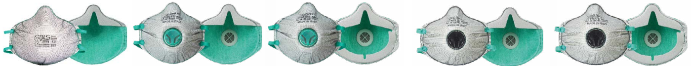
BLS Zer0 30 NV